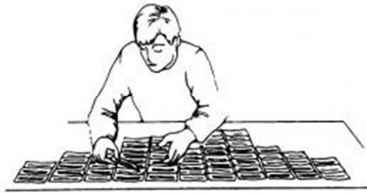
Figure 2. Q-sort Methodology.

Participant responses are analyzed using factor analysis. Unlike standard uses of factor analysis (often called R Methodology), the variables are individuals not traits. There are five basic steps in setting up this methodology:-